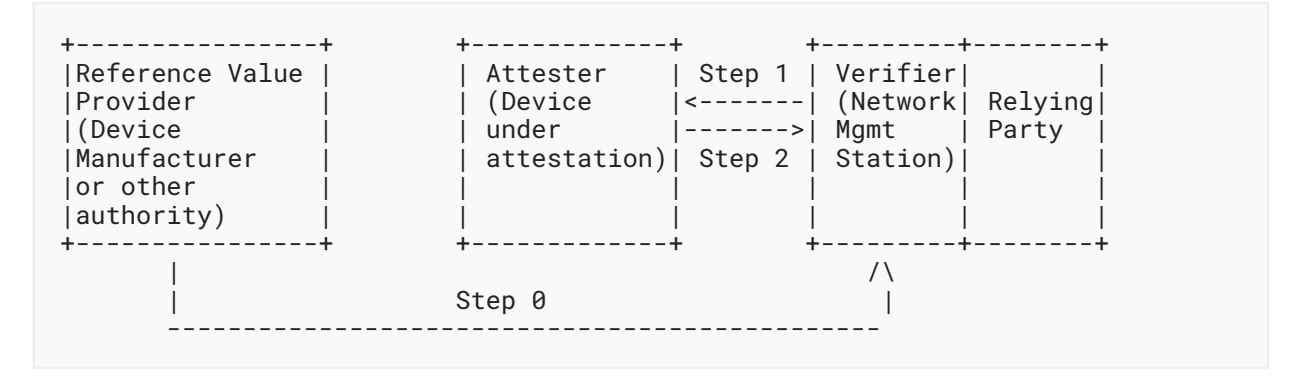
Figure 2: RIV Reference Configuration for Network Equipment

These components are illustrated in Figure 2.